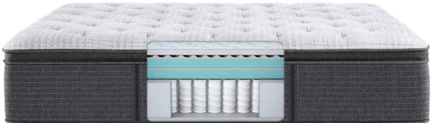
Illustration shows BRS900-C™ Plush Pillow Top. Other models will vary.

Dynamic Response™ memory foam has a supportive and unique feel to optimize your every move with conforming back support. It conforms and contours to your personal shape to help eliminate pressure points.